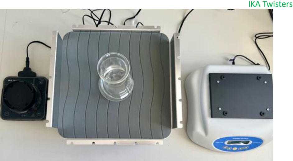
Figure 10. Varying sizes of orbital shaker platform sizes

The space occupied by each model of equipment was also measured (Figure 11). With lab space being 'prime real estate', the potential space saving offered by using the multifunctional IKA Twister could be advantageous to end users and technical staff.