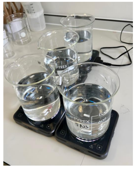
Figure 4. Four IKA Twisters powered by a single power source

A feature of the IKA Twister is it can be linked with other IKA Twisters to form multiple position stirrers powered by a single power source (Figure 4). The energy usage of multiple position stirrers was monitored at different set points (Figure 5).