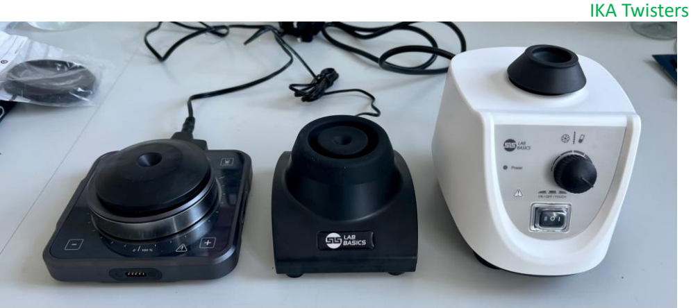
Figure 8. From left to right; the IKA Twister, SLS Vortex Mixers SLS 9602 and SLS 1620