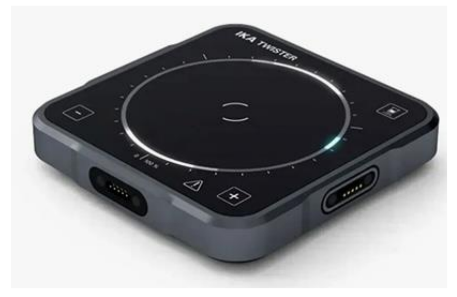
Figure 1. The IKA Twister

Wet labs employ a variety of equipment types for preparing and agitating materials. Vortex mixers, magnetic stirrers, and orbital shakers are routinely. IKA have recently released the IKA Twister (Figure 1), a product which can perform the functions of all three of these equipment types. Products such as the IKA Twister represent a response by industry to reduce the environmental impact of scientific research. Products which use less raw materials and reduce supply chain emissions are an essential component of the scientific sector becoming carbon neutral.