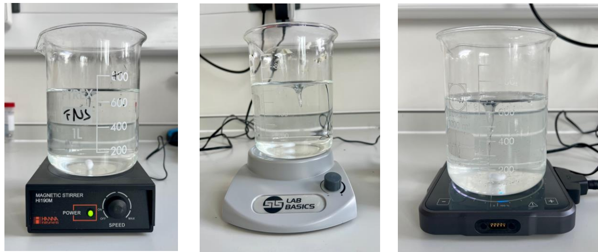
Figure 2. From left to right; Hanna HI

Alongside the IKA Twister, two magnetic stirrers were tested. All three units stirred an 800ml flask filled with 700ml of water. Both the Hanna and SLS Lab Basics stirrers (Figure 2) were operated at their maximum revolutions per minute (RPM) only. The reason being that both units had a dial control which made it difficult to set precise set points below their maximum RPM. The IKA Twister can be set to operate at increments of 100 RPM up to a maximum of 3000 RPM. The IKA Twister was also tested at its maximum RPM and also the maximum set points of the other two models (Figure 3).