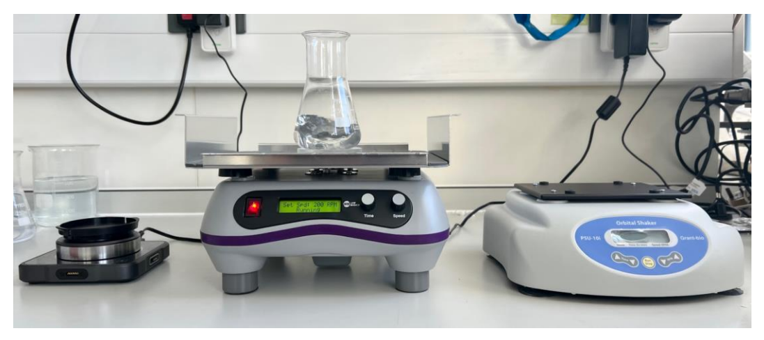
Figure 6. From left to right: the IKA Twister, SLS Lab Basics and Grant PSU-10i

With the addition of the TVWX Shaker attachment, MS 3.3 universal attachment, and STICKMAX II sticky pad, the IKA Twister was used as an orbital shaker. The IKA Twister was tested alongside two other orbital shakers at 200 RPM, with each orbital shaker agitating a single 250ml flask containing 100ml of water. Each model also employed a STICKMAX II to hold the flask in place (Figures 6and 7).