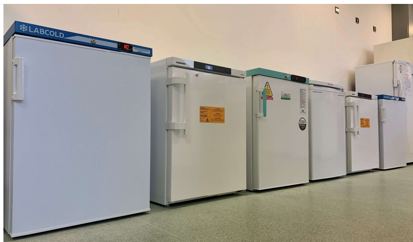
Figure 1. The three fridges and three freezers examined at the Learning and Research Centre, University of Bristol.

Fridges and freezers are widespread throughout scientific research and teaching. They are found in molecular sciences, life sciences, chemistry and stores departments throughout the UK. A range of models are available and lab operators may choose from a selection of units which will vary in their price & performance. With labs aiming to minimize their running costs, highlighting the models with the lowest running costs is a useful exercise. However, energy consumption values alone would not be serving end user requirements. This study aimed to highlight some of the data and criteria which should be considered when selecting the most sustainable solution based on the specific needs of the researcher, their laboratory and the materials they are storing.