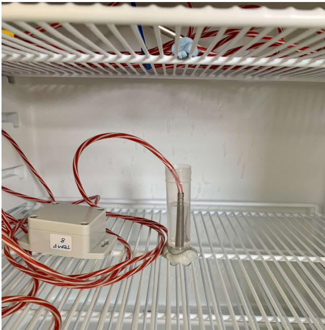
Figure 2. Sample probe was placed on the middle compartment of each unit. Central to the photo is the sample representative probe. Above this the probe in the top compartment can be seen.

Both the fridges and freezers were monitored using 3 temperature probes, each placed in the centre of their respective compartment. The middle compartment was monitored using a sample probe which was 10ml of glycerol (figure 2).