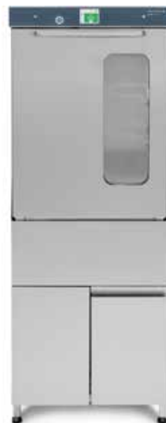
Getinge Lancer model 1300 LX labware washer; shown with optional View-In-Process (VIP) window.