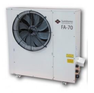
AIR COOLING UNIT