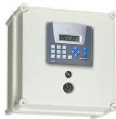
O2 depletion alarm