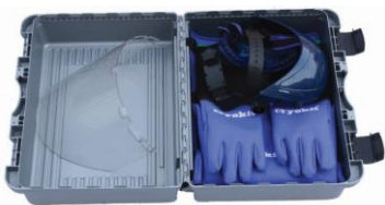
Cryogenic safety equipment