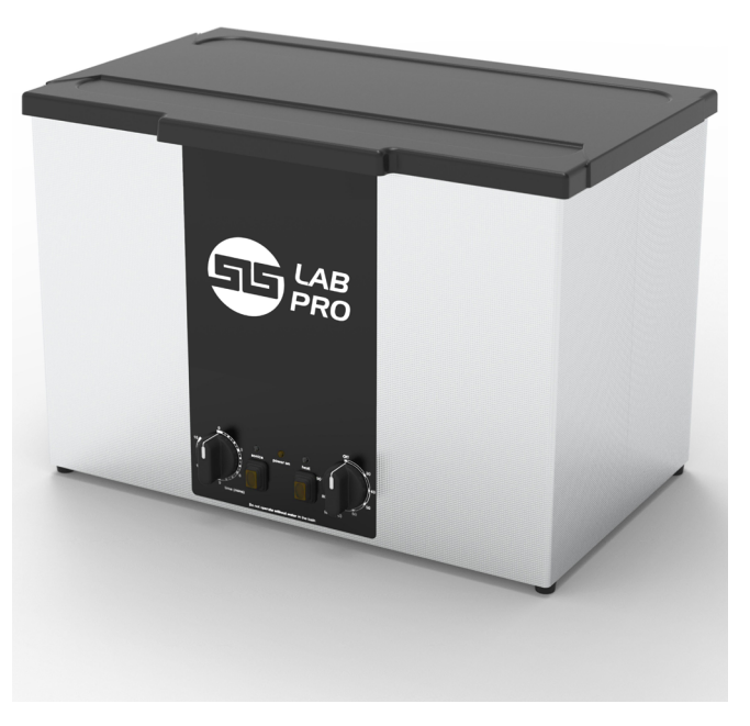
Specifications are subject to change for continual improvements

The SLS2026 provides the cost benefits of excellent entry level ultrasonics plus renowned quality and reliability.