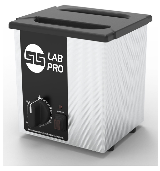
Specifications are subject to change for continual improvements

The SLS2004 provides the cost benefits of excellent entry level ultrasonics plus renowned quality and reliability.