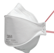
3M™ Aura™ Particulate Respirator 9330+