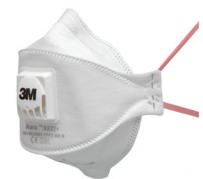
3M™ Aura™ Particulate Respirator 9332+