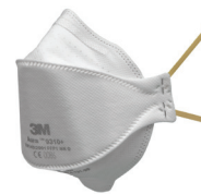
3M™ Aura™ Particulate Respirator 9310+