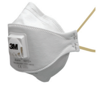
3M™ Aura™ Particulate Respirator 9312+