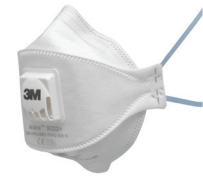
3M™ Aura™ Particulate Respirator 9322+