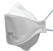
3M™ Aura™ Particulate Respirator 9320+