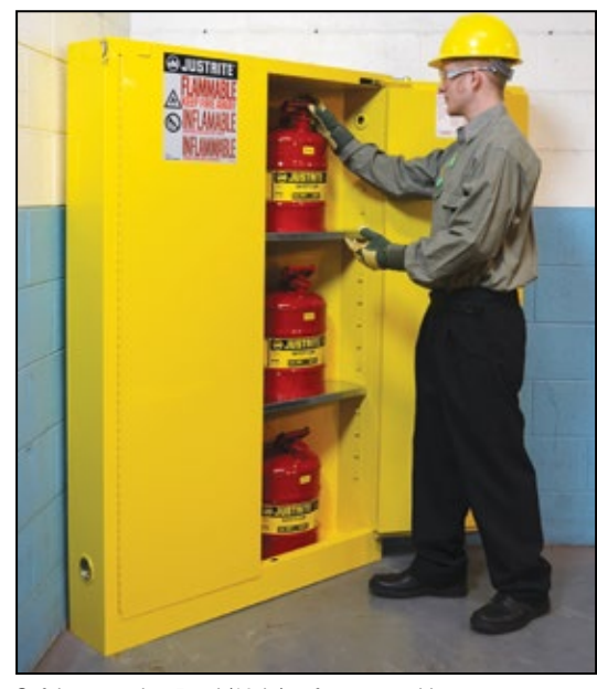
Safely store nine 5-gal (19-ltr) safety cans with room to spare.

Designed to meet OSHA, NFPA 30, and NFPA 1 standards, corner safety cabinets have all of the same features as the classic line of flammable safety cabinets including a fail-safe, three-point self latching door, double-walled construction with 1-1/2-in (38-mm) air space, dual vents, a grounding connector and a large trilingual warning label identifying contents. Patented Spillslope® galvanized steel shelves direct spills to the back and bottom of a leakproof 2-in (51-mm) sump.