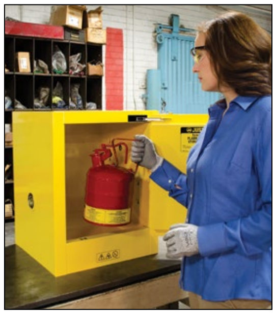
Place cabinets near points-of-use to save time by not going to a far away central storage area.