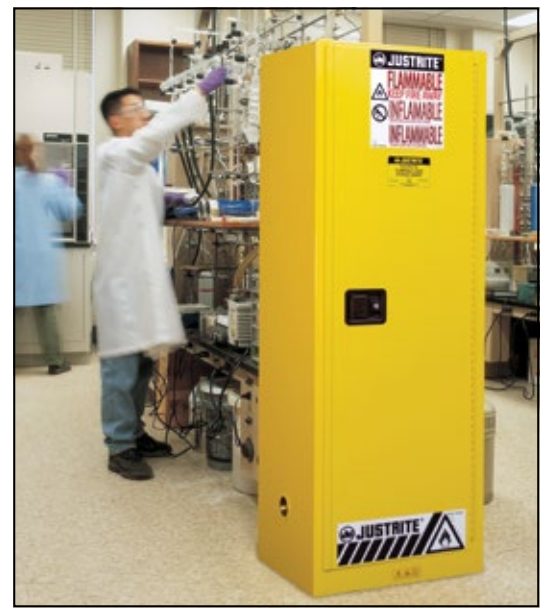
Place Slimline cabinet where floor space is limited.