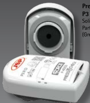
PressToCheck™ P3 (F-4003) Solid + Liquid Particles (Greater Capacity)