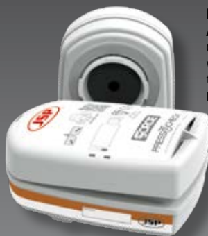
PressToCheck™ A2P3 (F-4123) Organic Vapours + Gases with boiling points greater than 65°C Solid + Liquid Particles