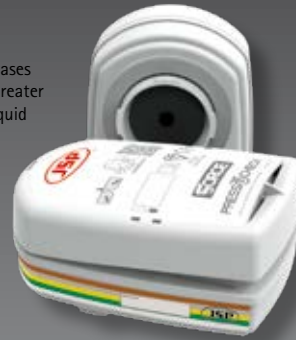
PressToCheck™ ABEK1P3 (F-4713) Organic / Inorganic/Acidic Ammonia Vapours and Gases plus Solid and Liquid Particulates