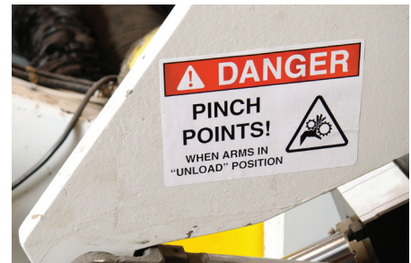
Safety and Facility ID