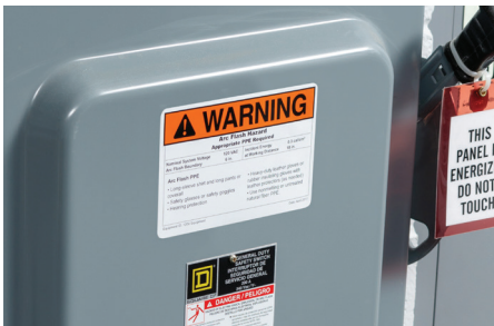
Arc Flash Labels

With a variety of possible color combinations, you can easily create identification labels for every area in your facility, including: