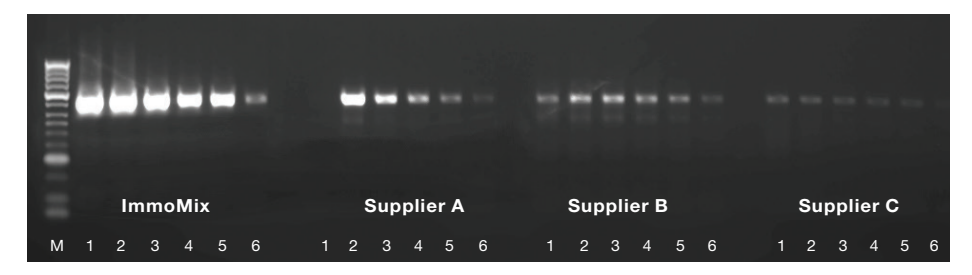
Fig. 2 Sensitivity of BioMix

A 1.8 kb fragment of the Rn18s gene was amplified using BioMix and a 2-fold serial dilution of mouse genomic DNA from 50 ng to 1.5 ng (lanes 1 – 6 respectively, HyperLadder 50bp (M)) under standard PCR cycling conditions. The results illustrate that BioMix delivers high-yield and increased sensitivity with low template concentrations.