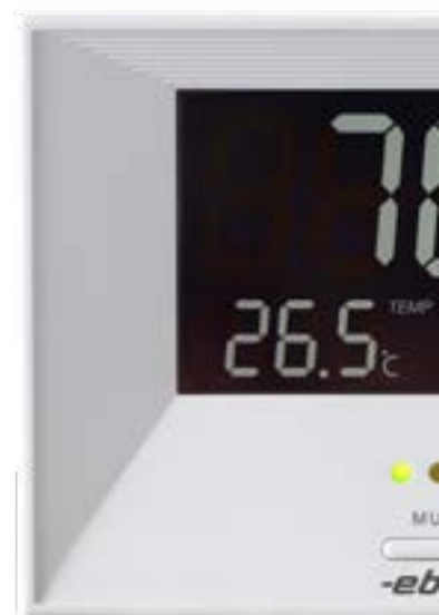
Room climate monitor RM 100 with clear measurement display and three LEDs indicating the CO 2 value in the air

The room climate describes the sum of the influences on the comfort of persons while being indoors. It is an essential component of the quality of living conditions and comfort, and is determined mostly by the air temperature and humidity , as well as the CO 2 value . The room climate monitor RM 100 measures these.