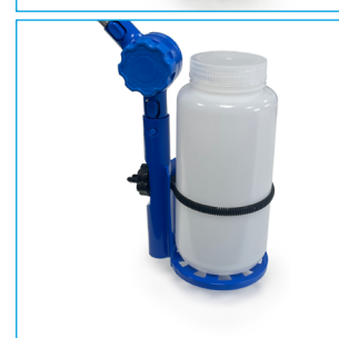
Bottle Holder 5065D

Suitable for bottles up to 95mm diameter. Price includes one 1000ml LDPE bottle