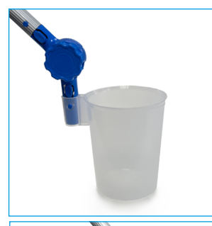
Angular Beaker 5065B

The beaker can be easily adjusted to the required angle