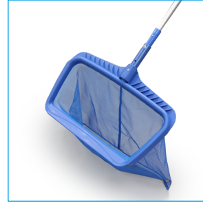
Deep Catch Net 5065N

Suitable for bottles up to 95mm diameter. Price includes one 1000ml LDPE bottle