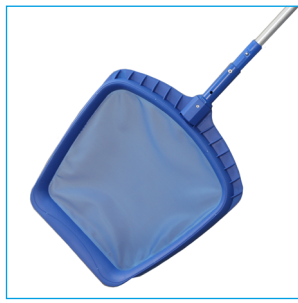
Surface Net 5065M

Ensures that you do not lose the sampler if accidentally dropped!