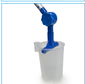
Pendulum Beaker 5065C

Sampling beaker made from 316L stainless steel