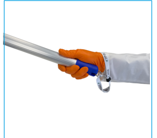
Wrist Strap 3111A

Ensures that you do not lose the sampler if accidentally dropped!