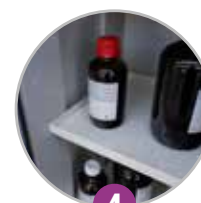
4 Shelves retention