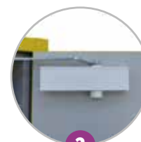
2 Self-closing doors with thermo-fuse