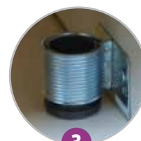
3 Adjustable leveling feet