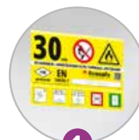
1 Standardized labeling