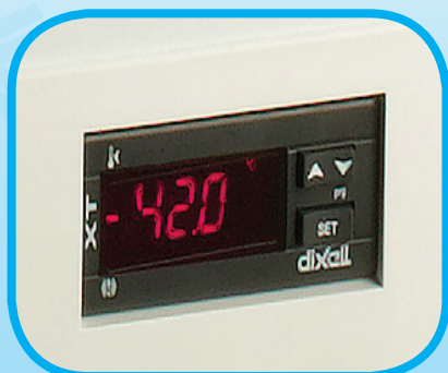
Digital Temperature Display

Bespoke racking can be provided if required as can baskets at an extra cost. To increase the life of your freezer and to ensure you get optimum performance, preventative maintenance contracts are also available. Why not ask for details when you order?