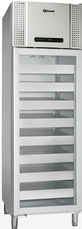
BioPlus 660D. Drawers and glass door are optional extras.

The BioPlus 600/660D range is designed for the storage of the most delicate biomaterials, in situations where even tiny fluctuations in conditions inside the storage cabinet can have a serious effect on the contents.