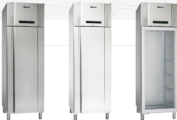
The BioPlus 600/660D is available as a refrigerator or freezer in either white or stainless steel finish. All BioPlus models come with self-closing door. Glass door is available for refrigerator.

In terms of performance, these units are designed to provide the very best results even under exceptional conditions. The BioPlus utilises environmentally responsible HFC-free foam propellants and is available with CFC-free or HFC-free refrigerants.