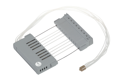
24073297/N15135 SMART small tube metal tip dispensing cassette