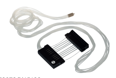
24072678/N15139 SMART long standard tube dispensing cassette