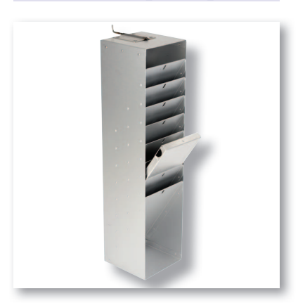
Blood bag storage. (4800 illustrated)