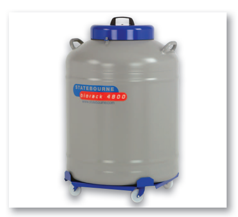
All BioRack models have a roller base option for easy manoeuvrability