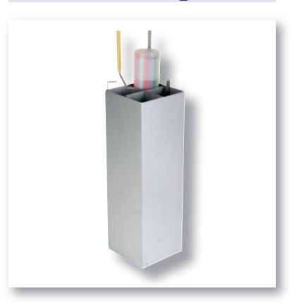
Straw storage rack (6000 illustrated)