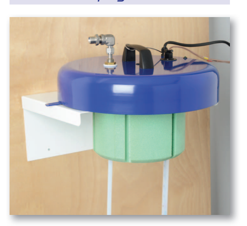
Bio Rack alarm plug rack, fits easily onto wall and stops any damage to sensors whilst accessing samples