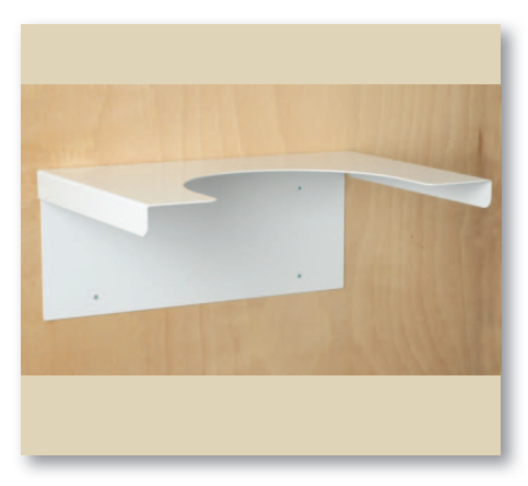
Bio Rack alarm plug rack Can also be used with a standard neck plug