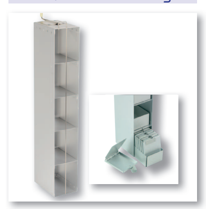
25 ML Cord blood bag storage (4800 illustrated)