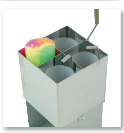
In Place of the racks for storing cryoboxes, six special racks can be supplied, each rack holds four 67mm diameter canisters.