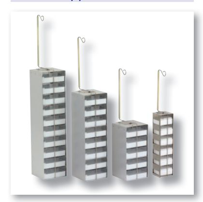
Supplied racks inc 2ml and 5ml cryovial storage in Cryoboxes.