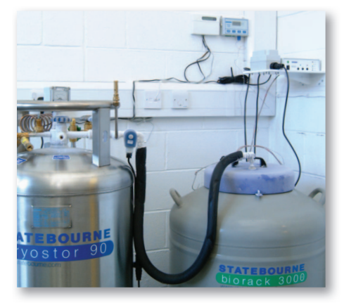
Bio Rack Autofill and Cryostor option (see next page) connected to Data logger low level alarm and autodialler.