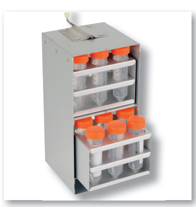
50 ml Falcon Tube storage. (3000 illustrated)