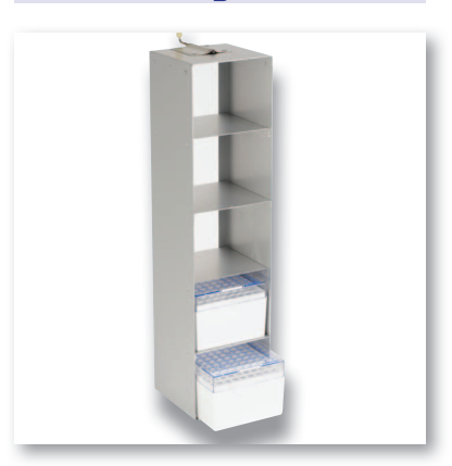
5 ml Cryoboxes. (4800 illustrated)