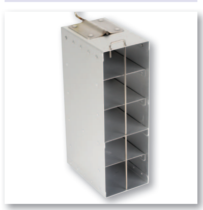
96 well plate storage. (4800 illustrated)