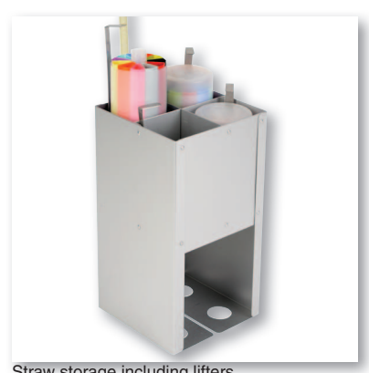
Straw storage including lifters (3000 illustrated)