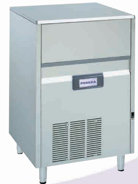
KF145 (E) KFP145 (E)