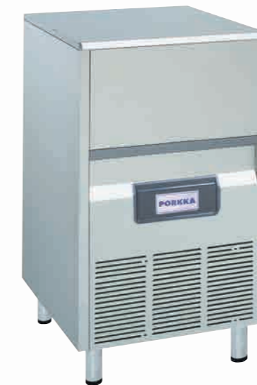
KF85 (E) KFP85 (E)