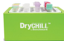
Item: DC4020 40 x 1.5/2.0 ml tubes