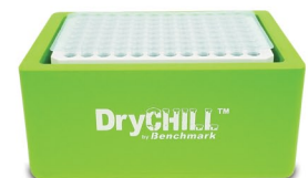
Item: DC9602 96 x 0.2 ml tubes or 1 x PCR plate