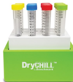
Item: DC1215 12 x 15 ml tubes (16-17mm)