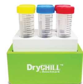
Item: DC0650 6 x 50 ml tubes (29mm)

The DryChill cooling blocks are designed to store samples safely on the lab-bench without sample degradation due to temperature increase or fluctuation. Unlike traditional ice buckets, these blocks do not require any ice and are uniquely designed to minimize condensation, resulting in a convenient, mess-free cooling.