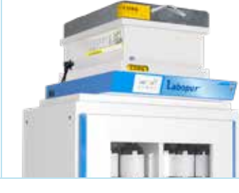
Module with 1 active charcoal filter + 1 security filter