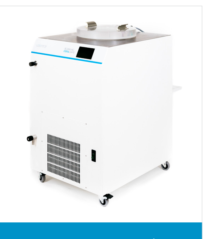
CoolSafe Superior Touch XL/XS