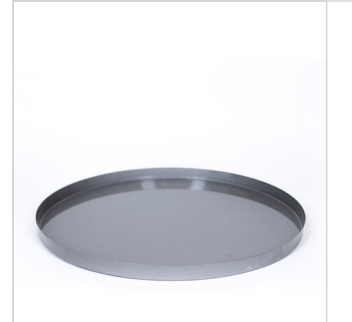
Tray 500 Extra stainless steel tray ø435 x 23 mm for CCS 500 E chamber.

Included are the connection kit and product sensor. Lid with 40 NV flange and NV 40 flex hose for connection to the CoolSafe are also included.