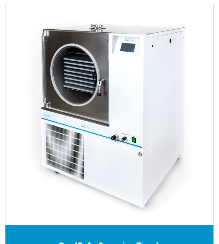
CoolSafe Superior Touch