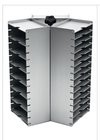
Rack micro-titre plate Rack for 3 x 14 micro-titre or 3 x 7 micro-titre plates for CCS

Extra rack for CCS 300 including 3 shelves and trays for pre-freezing.