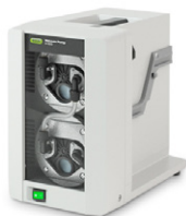
Vacuum Pump V-300 The economical and silent vacuum source