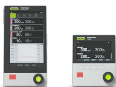
Interface I-300 / I-300 Pro Convenient process regulation and monitoring