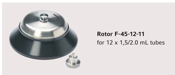
Rotor F-45-12-11 for 12 × 1,5/2.0 mL tubes