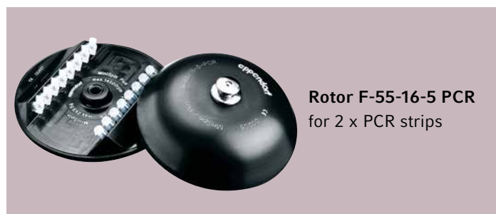
Rotor F-55-16-5 PCR for 2 × PCR strips