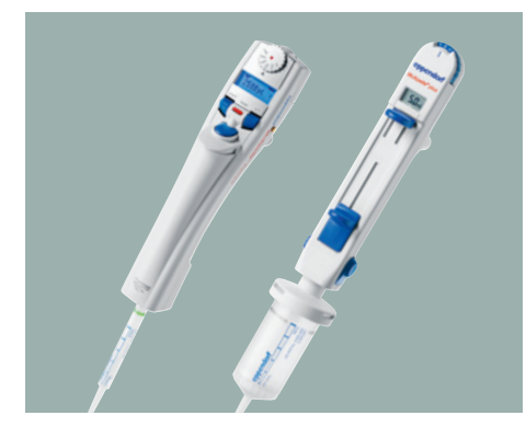
A perfect team

With 9 volume sizes (0.1 mL to 50 mL) and 3 purity grades (Eppendorf Quality, PCR clean and Eppendorf Biopur) you will always find the perfect Combitip for your application! The »Biopur« tips are individually blisterwrapped and feature an access tab which makes them easier to open, even with gloves!