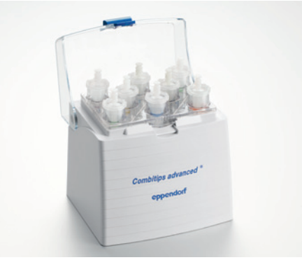
Always easy to reach

Whether Multipette 4780, Multipette plus, Multipette stream or Xstream – the Combitips advanced are optimized for all Multipette models to create the perfect connection!