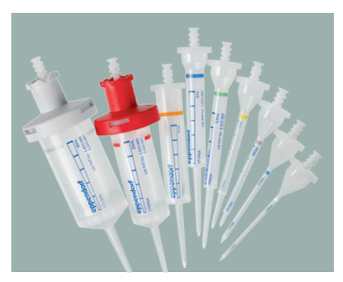
Made of virgin polypropylen. Free of slip agents, biocides and plasticizers.