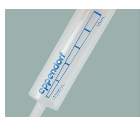
Optimized graduation Visibility of liquid volume using optimized graduations

Complete emptying of all common tubes prevents sample loss (see table on page 4)