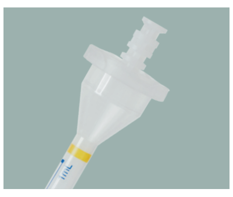
Ergonomic design Unique funnel geometry prevents damage to gloves and ensures comfortable handling