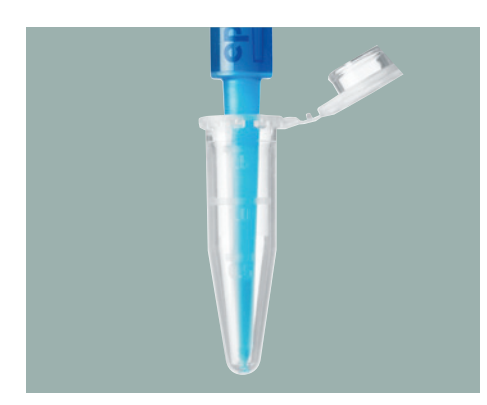
Elongated tips (for 2.5 mL, 5 mL and 10 mL)

Quick identification of the desired Combitips facilitates the workflow (color coding is also visible on packaging!)