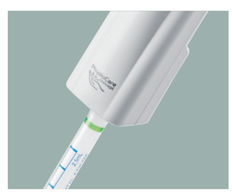
Multipette connection Automatic Combitip recognition and volume calculation