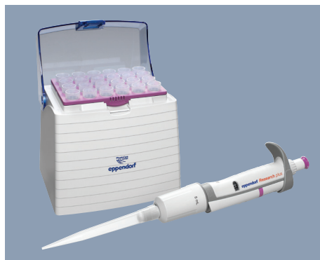
Precise one-step pipetting with Eppendorf pipettes and epT.I.P.S.® 5.0 mL