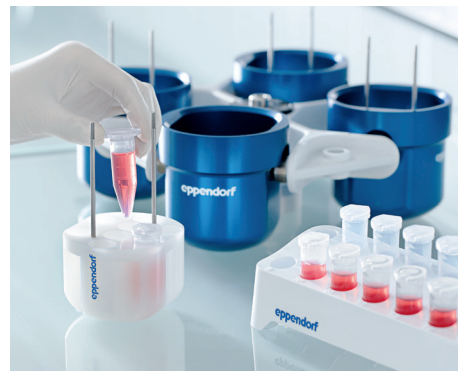
Optimized adapters for existing swing-bucket and fixed-angle rotors