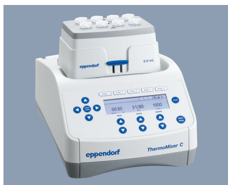
Perfect mixing, heating and cooling with the ThermoMixer C