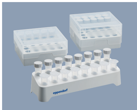
The ideal solution for sample preparation and storage: new racks and storage boxes