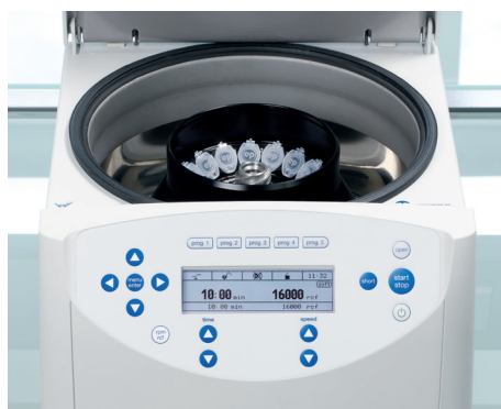
Safe centrifugation with Eppendorf Centrifuges