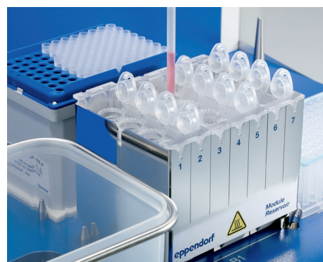
Easy integration in the epMotion automated pipetting system