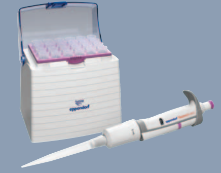
Precise one-step pipetting with Eppendorf pipettes and epT.I.P.S.<sup>®</sup> 5.0 mL