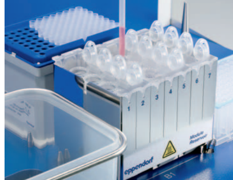
Easy integration in the ep Motion automated pipetting system