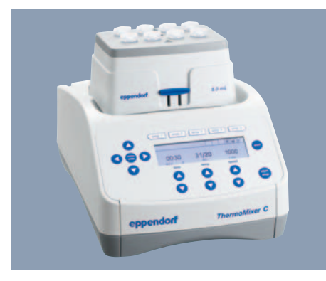
Perfect mixing, heating and cooling with the ThermoMixer C