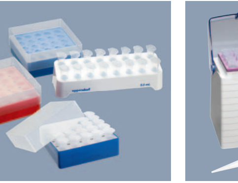
The ideal solution for sample preparation and storage: new racks and storage boxes