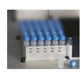
Automation Ready: Available with a slit septum cap, Mini-UniPrep can be used with standard robotics on HPLC instruments.