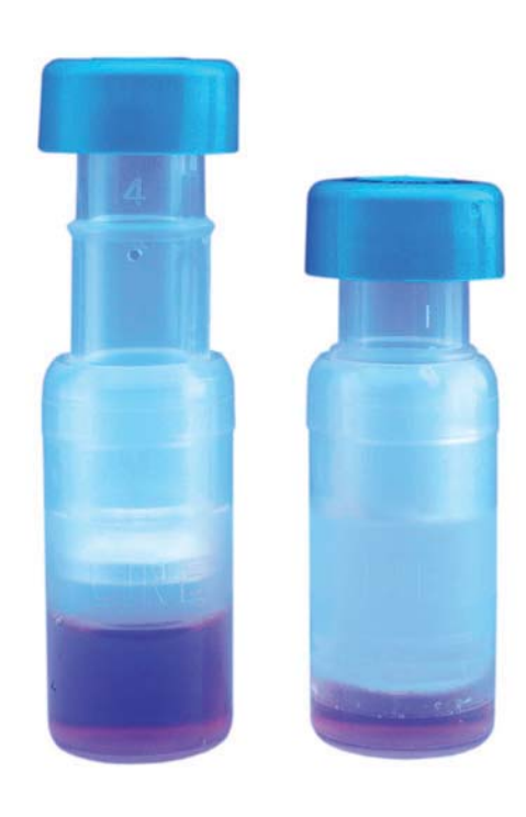
The Mini-UniPrep filter on the left is shown with fluid in the chamber. On the right, the filter plunger is shown compressed with the sample ready for analysis.