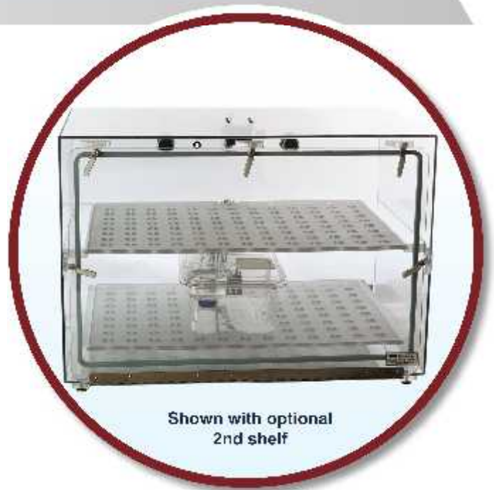
Shown with optional 2nd shelf

Custom sizing available. Contact us to discuss your needs.