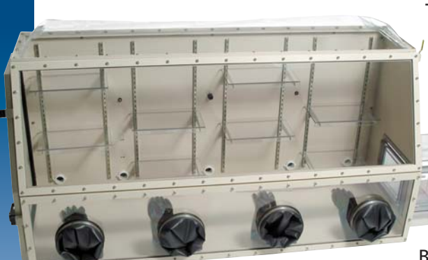
ALUMINUM GLOVE BOX

Ball Valves make it easy to purge in a desired gas mix for oxygen or moisture control.