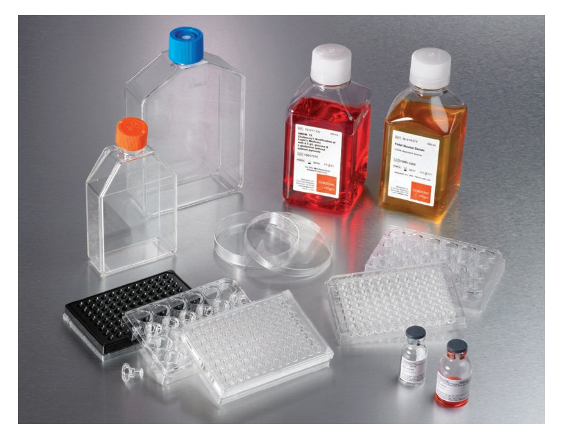
Tools for in vitro and in vivo analysis of stem, progenitor, and differentiated cell types.