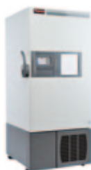
Thermo Scientific Ultra Low Temperature Freezers