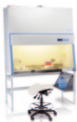
Thermo Scientific Biological Safety Cabinets