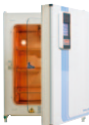
Thermo Scientific Incubators