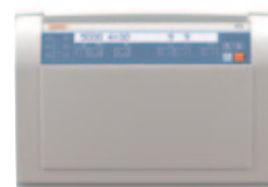
Thermo Scientific Centrifuges and Rotors

©2011 Thermo Fisher Scientific Inc. All rights reserved. All trademarks are the property of Thermo Fisher Scientific Inc. and its subsidiaries.