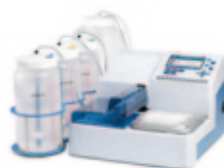
Thermo Scientific WellWash Versa