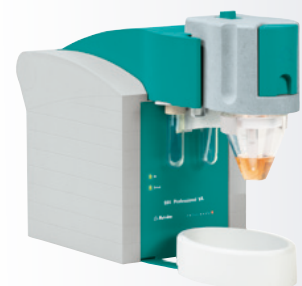
Multi-mode Electrode (MME)