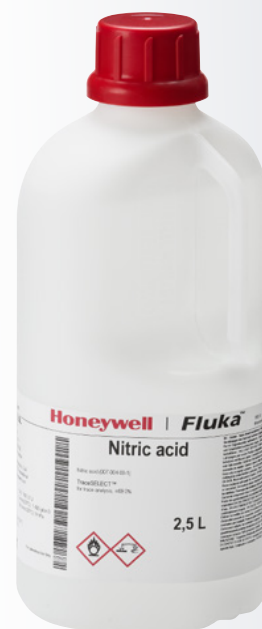
Honeywell Fluka - Nitric Acid TraceSELECT 84385-2.5L

The Honeywell Quality Management System guarantees consistent quality and safety for all TraceSELECT Ultra and TraceSELECT products. The reagents are produced and bottled under clean-room conditions.