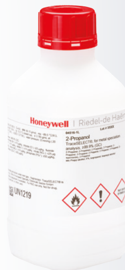
Honeywell Riedel de Haën - 2-Propanol TraceSELECT 04516-1L

The elemental response is usually independent of species, so it is often possible to quantify a species even when its structure is unknown (assuming good HPLC recovery). Identification, however, is based solely on retention time matching. Therefore, a compound in the sample can be identified only by comparison with a standard.