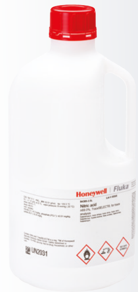
Honeywell Fluka - Nitric Acid TraceSELECT 84385-2.5L

The reduction of metals into mercury is more favourable than reduction to the solid-state electrode. Further on there is always a clean new Hg electrode surface available for each measurement.