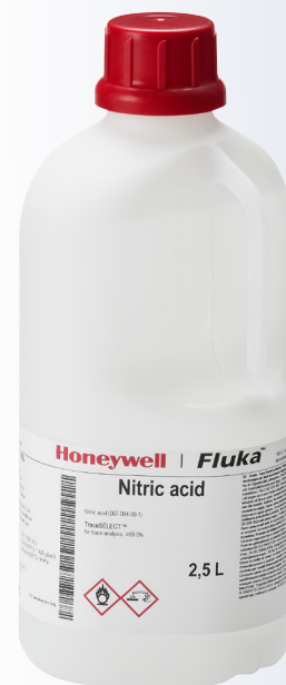
Honeywell Fluka - Nitric Acid TraceSELECT 84385-2.5L

The Honeywell Quality Management System guarantees consistent quality and safety for all TraceSELECT Ultra and TraceSELECT products. The reagents are produced and bottled under clean-room conditions.