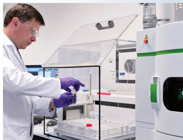
Atomic Emission Spectroscopy Analysis

With Honeywell's analytical reagents, superior quality and safety standards are a prime focus. We use a comprehensive Quality Assurance System in line with EN 29001 (ISO 9001) and each of our products is manufactured to clear, guaranteed specifications. We employ a large variety of modern analytical methods, such as inductively coupled plasma optical emission spectroscopy (ICP-OES), inductively coupled plasma mass spectrometry (ICP-MS), flame atomic absorption spectroscopy (AAS) and graphite furnace AAS (GF-AAS). This allows for specifically tailored control and analysis procedures for each product.