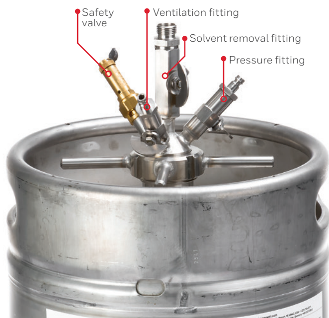
Dispensing head for containers with integrated dip tube